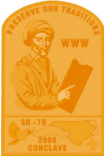
Ghosted Section SR-7B Delegate Patch